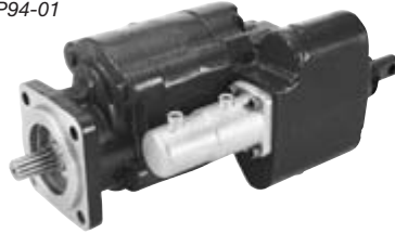
Muncie E Series Pump with Air Shift Option