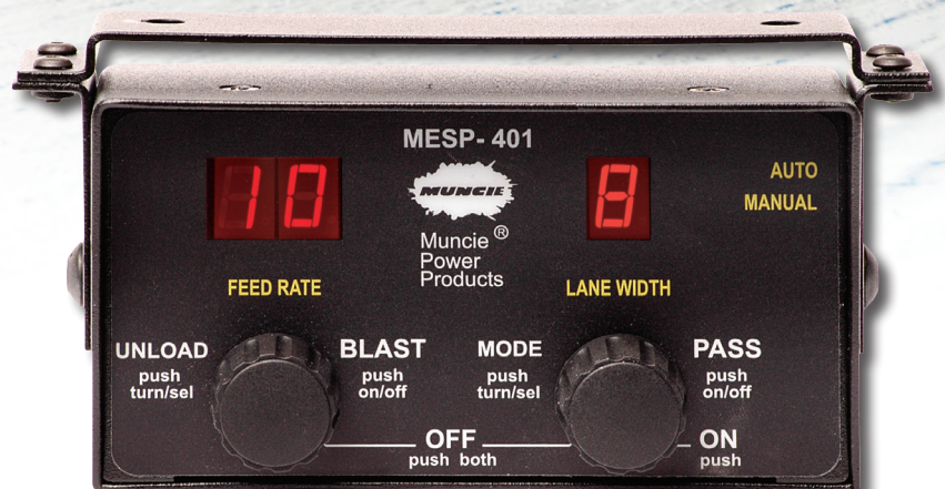
MESP 401A Spreader Controller