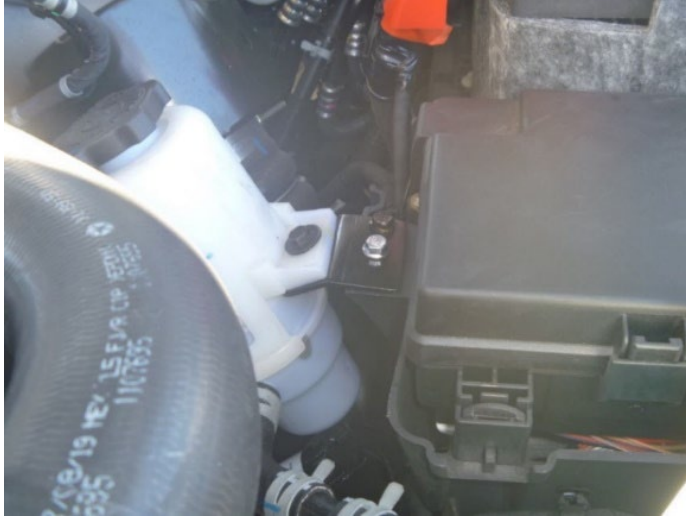
Power Steering Hose Clearance Hardware (26-27)

NOTE: Will NOT Work w/ 6" O.D. Clutch NOTE: For Use w/ Trucks Equipped w/ Lane Departure