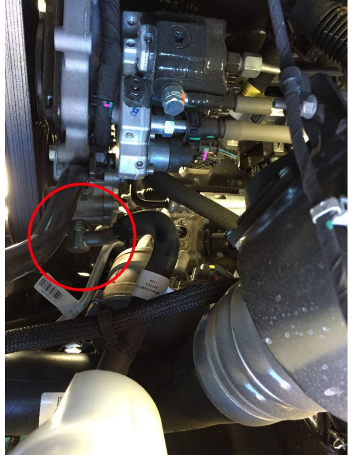
Power Steering Fitting (29) (For Lane Departure Trucks)