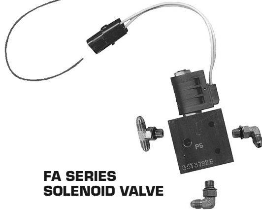
FA SERIES SOLENOID VALVE

FA Series PTO Solenoid requires diode protection by vehicle manufacturer.