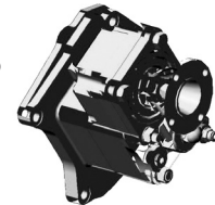
RS4S-P86 Mercedes Adaptation