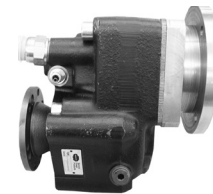
RS4S-P86 Eaton Adaptation